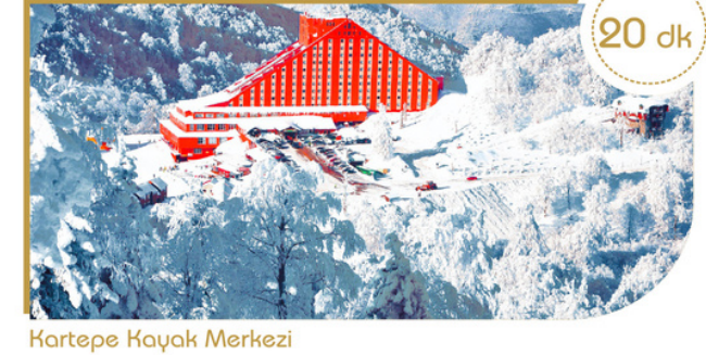
Kartepe Kayak Merkezi