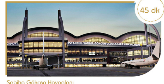
Sabiha Gökçen Havaalanı